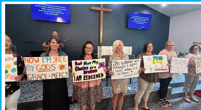
RECENT GRADUATION SERVICE—CARD BOARD TESTIMONIES

Help us fight this epidemic. Funding is needed and the need never stops. Thank you everyone who pours into this ministry; time, talents and treasures. You are greatly appreciated. Together WE can IMPACT the world for good and for GOD.