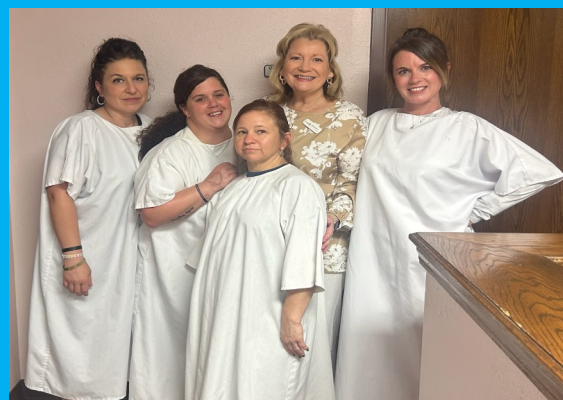
Recent Baptism and Balloon Ceremony

The good old summertime has been on full display here in South Alabama with temperatures to prove that we are still a long ways from fall. Summer time is often a challenging time for nonprofits and is often viewed as an “off season” for fundraising. Less donations are usually made during the summer months of July and August than the rest of the year. However, the cry for help from those struggling with addiction is not quieted for a more opportune moment. At Home of Grace for Women, we must answer that cry when it is made, no matter the season. Proverbs 10:5 states that “he who gathers crops in summer is a prudent son, but he who sleeps during harvest is a disgraceful son.” We cannot sleep now for the harvest of souls is waiting. Many of you have been so faithful to help meet the needs of these beautiful women amidst the rising costs of food and utilities. As we are preparing for our upcoming fundraiser in September, we are reminded of God’s faithfulness to the HOGW throughout 51 years. His mighty hand is still providing for a call that He placed in Mrs. Littleton so many years ago. We want to personally invite each of you on September 10, to share with us in celebrating those 51 years of God’s faithfulness to us and rejoice in the harvest of souls whose lives have been restored.