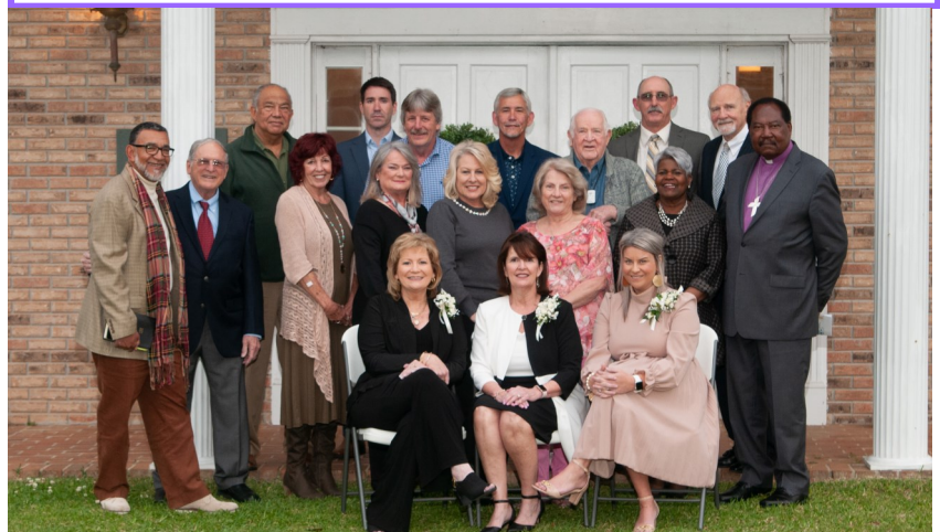
Home of Grace for Women Board of Directors